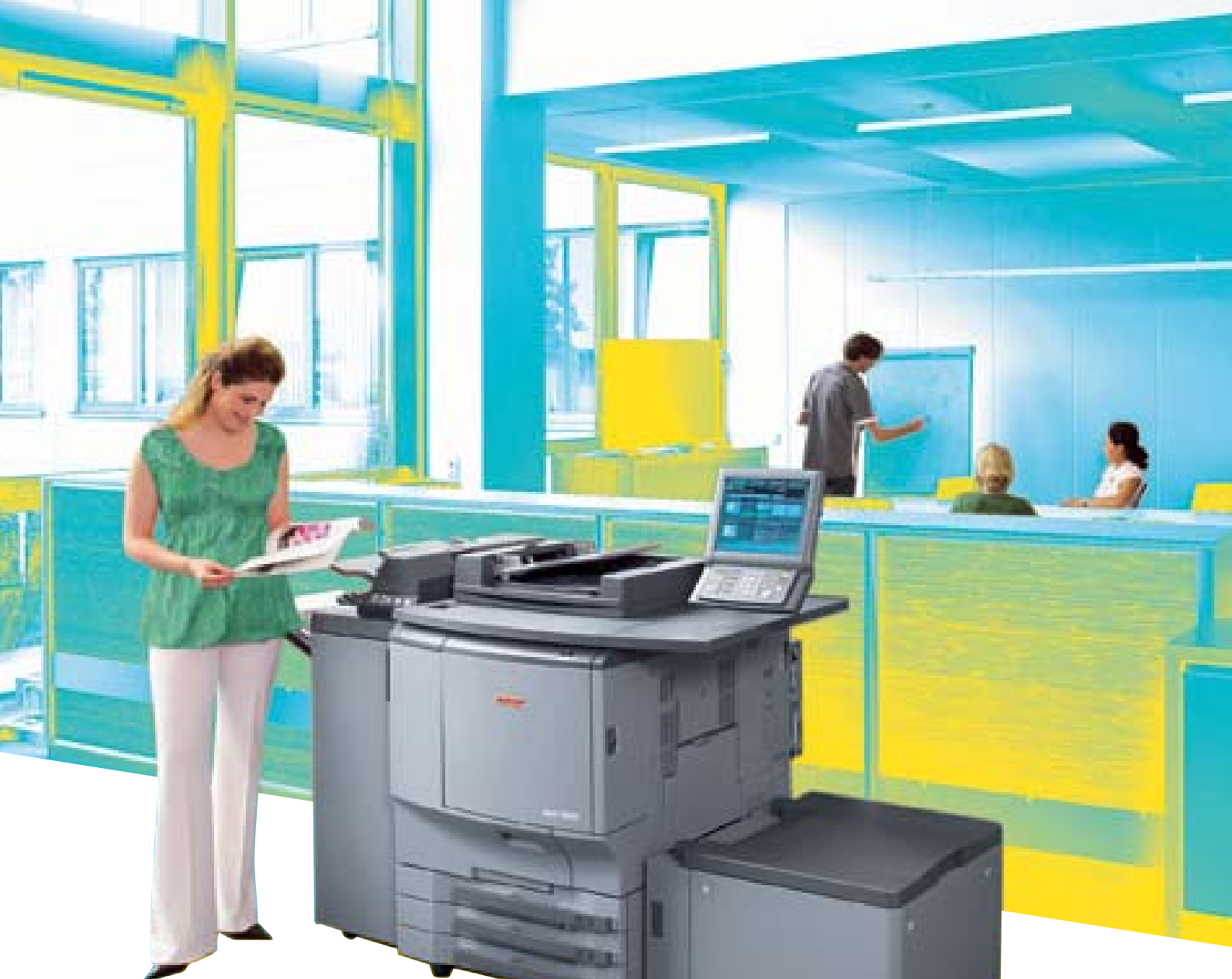
ineo+ 5501 with document feeder (DF-609), allround finisher (FS-607), post inserter (PI-502) and large capacity cassette (LU-202)