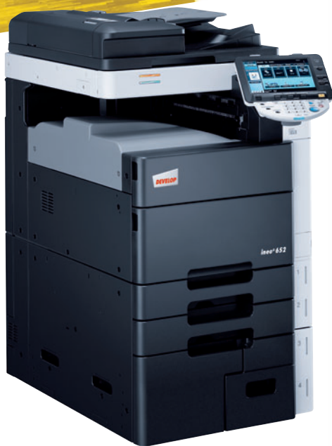
ineo+ 652 with output tray (OT-503)