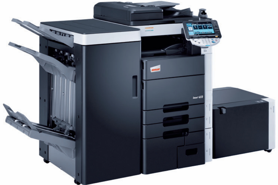
ineo+ 652 with staple finisher (FS-526), saddle kit (SD-508), working table (WT-506), biometric authentication (AU-102) and large capacity tray (LU-204)