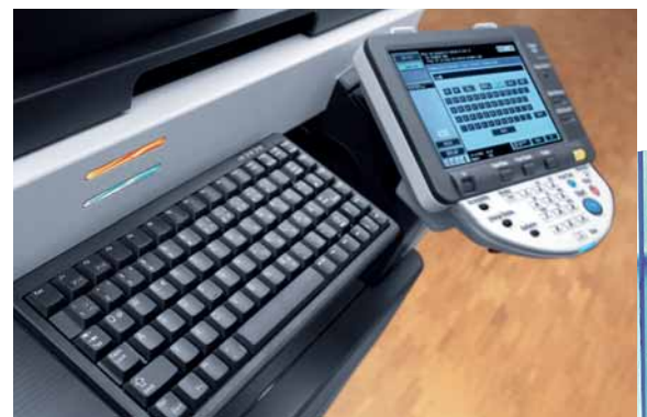
ineo 283 colour touchscreen display and the optional keyboard

A perfect team: Profit from the ineo 283 for all your monochrome printing and copying while the ineo+ colour systems guarantee professional colour output – a cost-efficient combination for high-quality office document production.