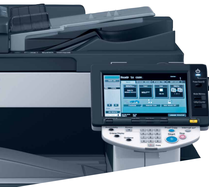
ineo 283's easy to use colour touchscreen display

The high print quality combined with a wide range of finishing functions allow professional office documents like brochures to be printed inhouse. Add to that the ability to punch and staple and office productivity will be enhanced even more.