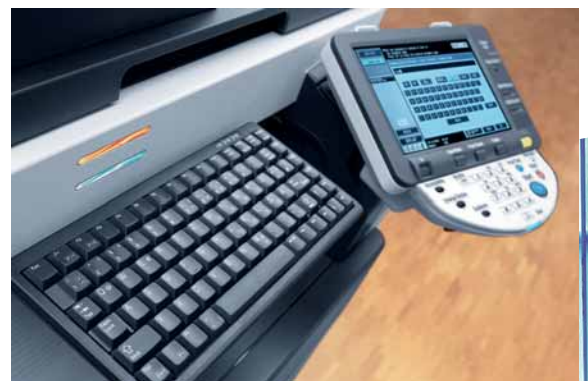
ineo 423 colour touchscreen display and the optional keyboard

A perfect team: Profit from the ineo 423 for all your monochrome printing and copying while the ineo+ colour systems guarantee professional colour output – a cost-efficient combination for high-quality office document production.