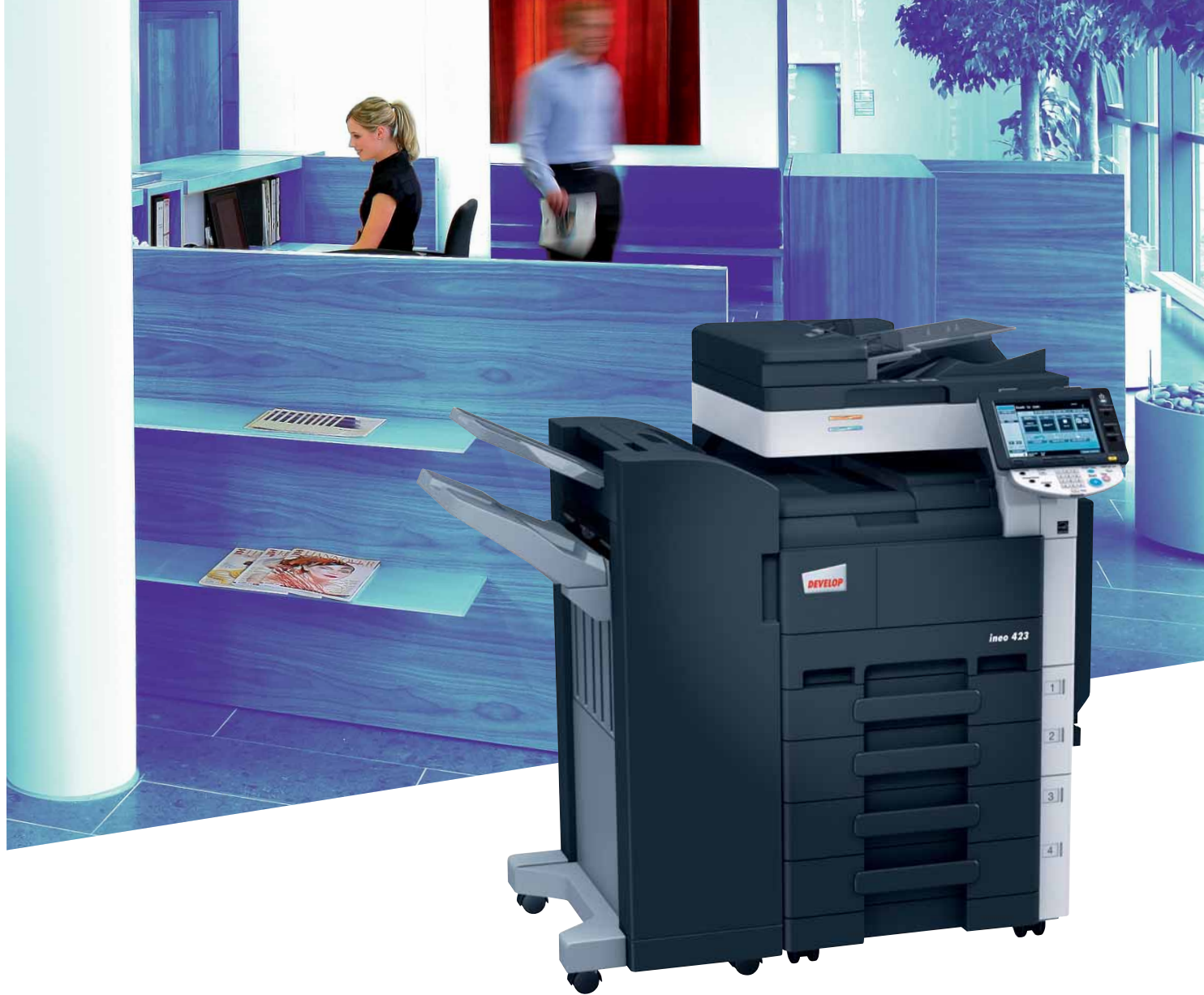
ineo 423 with floortype finisher (FS-527) and paper cassette (PC-208)